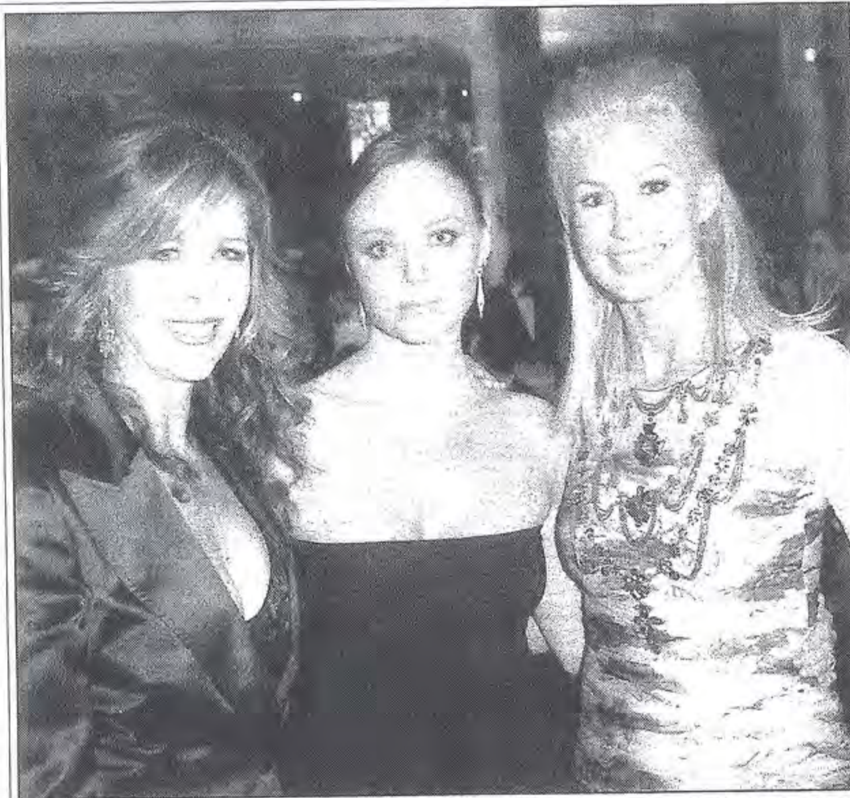
SHOWING GREAT COURAGE —Fashion designer Stella McCartney (center) was honored with "The Courage Award" at the 7th Annual "An Unforgettable Evening" gala held at the Beverly Wilshire Hotel. Sponsored by Saks Fifth Avenue and Cedars-Sinai Medical Center, the annual event raised $1.5 million for Cedars-Sinai Research for Women's Cancers. McCartney was recognized for her ongoing crusade to raise awareness for the cause. Her mother, Linda McCartney, lost her two-year battle with breast cancer in 1998. Pictured above (with McCartney) are Honorary Event Chair Rita Wilson (left) and Faith Hill (right), who supplied the evening's spectacular entertainment. Over the past eight years, Saks Fifth Avenue and Cedars-Sinai Research for Women's Cancers have raised over $15 million for research toward a cure for gynecologic and breast cancers.