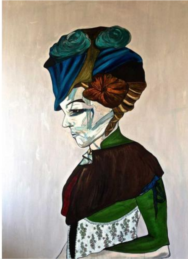
Nille Bech, Woman in Profile, Acrylic & oil on canvas, 150 x 200, 2017