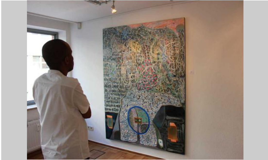
Reality, Illusion, Grotesque 2018, Vernissage in der Pashmin Art Gallery Hamburg, © PAG Hamburg 2018